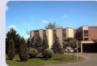
Above from left to right: CLSC Jean-Olivier-Chénier, St-Eustache Hospital, CLSC Mirabel